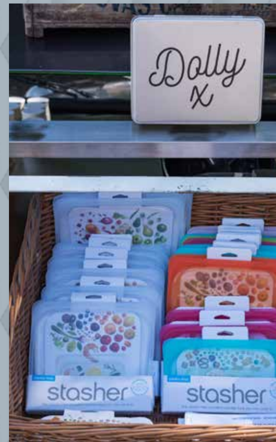
Dolly's storage tin, reusable silicone Stasher bags and water refill station.

Dolly's newest addition is sure to surprise and delight! Recently fitted with a very special tap, accessed from her iconic front grill, Dolly now supplies chilled mineral water for free to guests who have their own reusable bottles. Bottles will also be available from Dolly's shop.