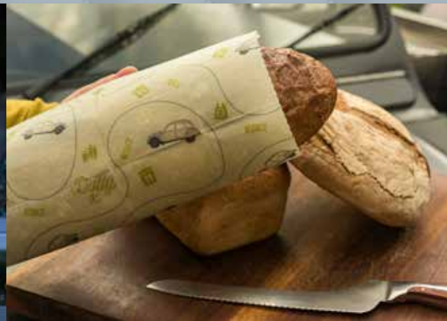
Eco pop-up shop and demo station